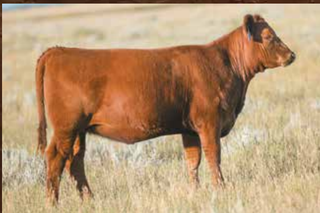
HRR FREYA 520 – DONATION HEIFER