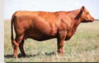
HRR FREYJA 357 Dam of donation Heifer