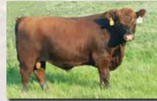
RIDGE RAD 9075 Sire of donation Heifer