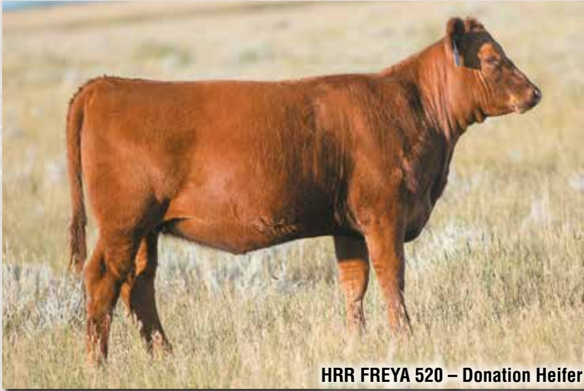
HRR FREYA 520 – Donation Heifer